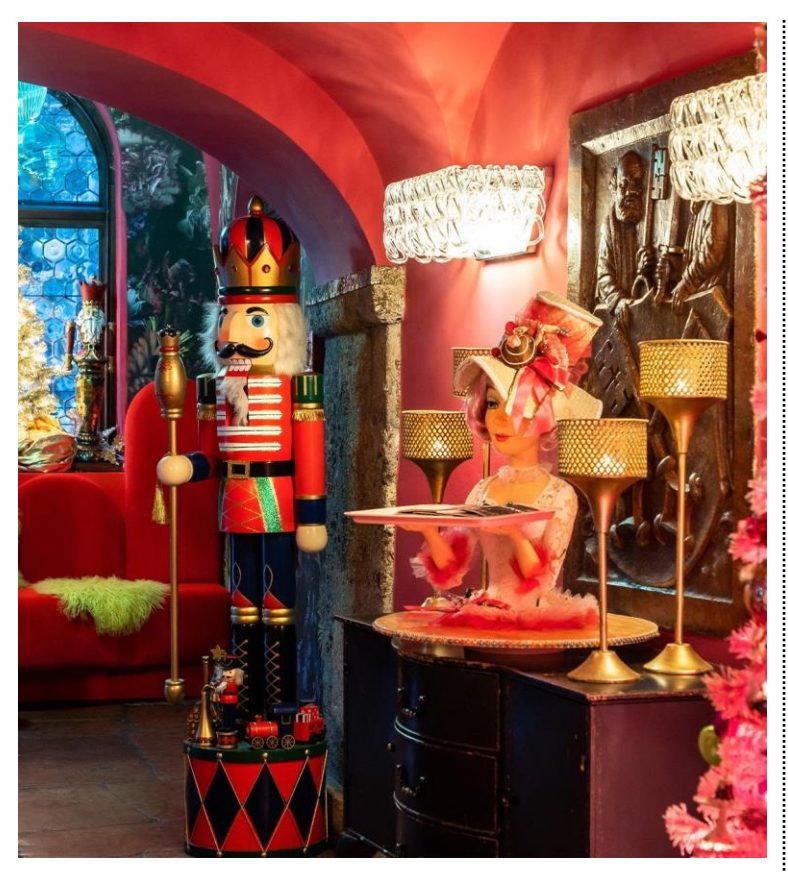
8 Days • 10 Meals : 6 Breakfasts, 1 Lunch, 3 Dinners

HIGHLIGHTS... Innsbruck, Choice on Tour: Innsbruck City Tour or Museum of Tyrolean Heritage, Seefeld, Carriage Ride, Salzburg, St. Peter's Restaurant, Oberammergau, Munich, Christmas Markets